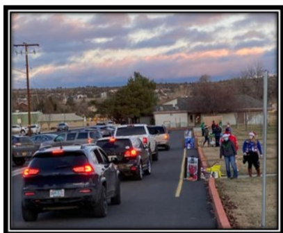
Buff Elementary celebrated with a "Winter Drive Thru" - capturing moments of joy from students and families as they welcomed winter break.