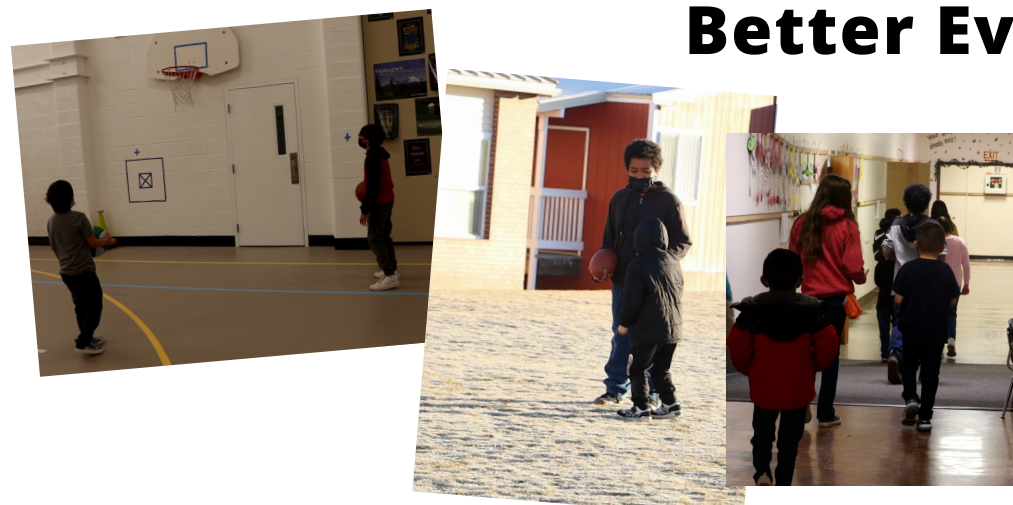
Metolius Elementary [Above] - The school recently started a new mentorship program! 5th grade students spend time every week with 1st graders and help them understand how to be safe, respectful and responsible in all areas of the school. Find a video about this program on our YouTube channel!